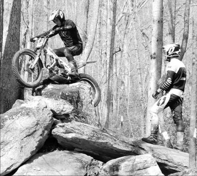
Annual Trackrock Trials

Information about the The Southeastern Trials Campground and directions Riders Association (STRA) is can be found at www.tracka group of members located rock.com or on at Trackin 7 southeastern U.S. states. rock Campground & Stables. N(Mar8,M2)CA